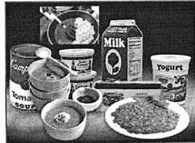
A temporary soft diet

mouthwash or a warm salt water solution. Dissolve one teaspoon of salt in one cup of warm water, and gently swish, then carefully spit. Three times per day is sufficient.